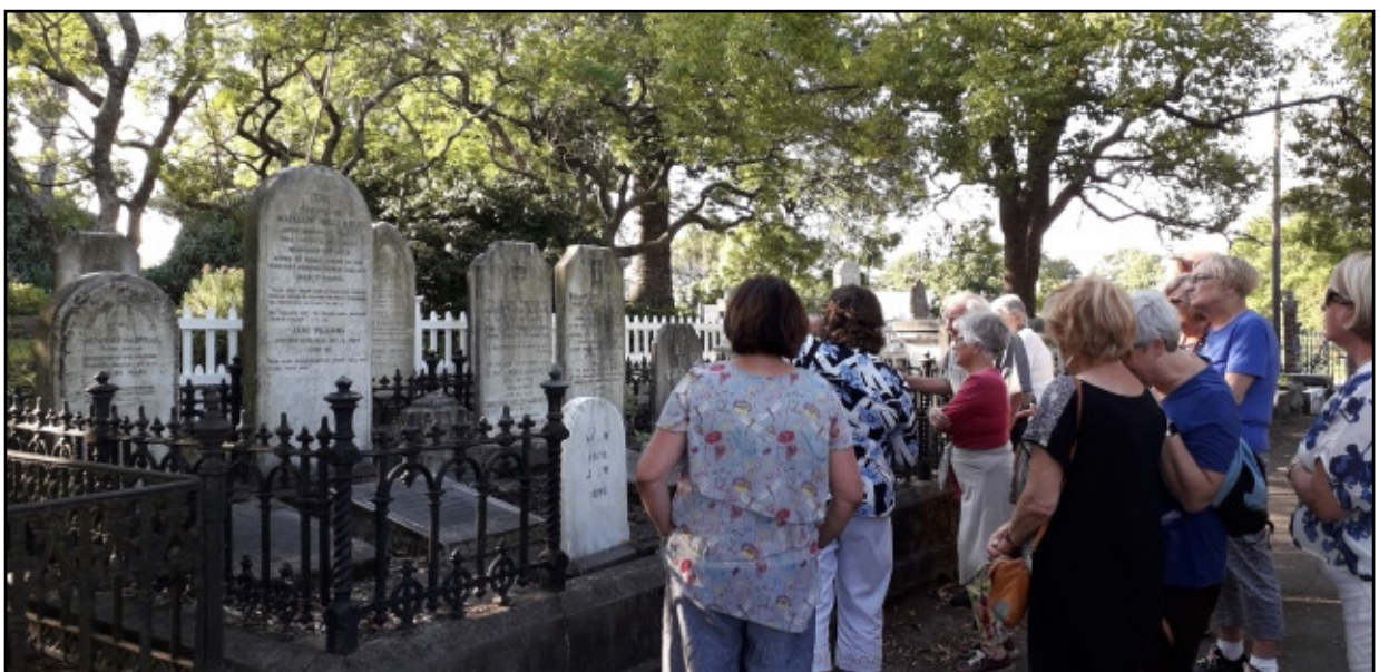
Members learning about the lives of the early settlers.

We have also continued to support Starlight and Look Good Feel Better, both organisations that empower people and help them to evolve; creating better outcomes - more fulfilling lives.