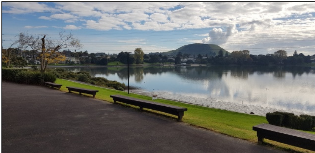
A beautiful venue when the tide is in!