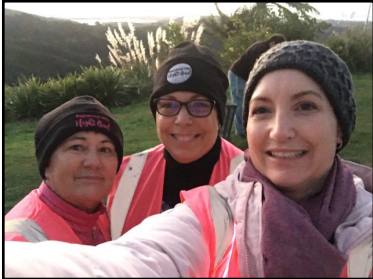
All ready to go!

Tauranga Central has focused on two charities over the past few months. Firstly we have donated to Bay Music Scholarships which has allowed two talented children to attend music classes this term who would otherwise not have been able to afford the tuition fees.