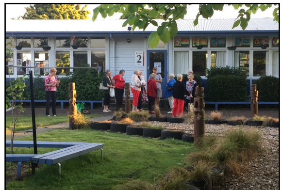
Members hearing about different aspects of the gardens.