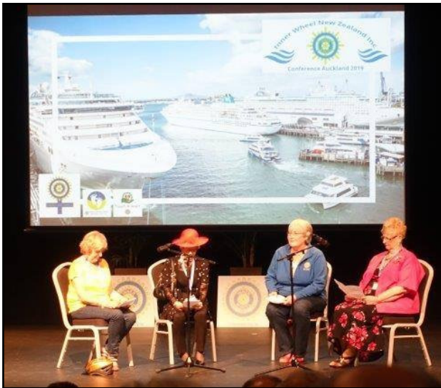
A skit performed by members of the Ahuriri club