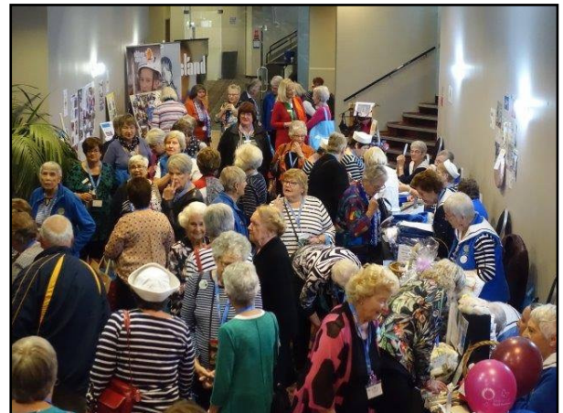
"The Meeting Place"