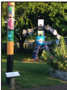
The "boy" and "girl" structures made by students.

We were very impressed with the ongoing commitment from everyone at the school to continue to develop this very worthwhile project. It teaches the students so much more than growing plants.