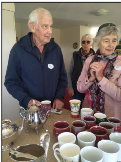
Members and friends enjoying fellowship and food!

At the end of the day we were able to send the Breast Cancer Foundation a sizable cheque. It was a very enjoyable and successful morning.