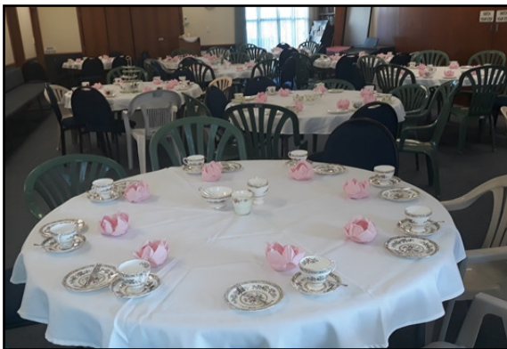
Beautifully decorated tables and scrumptious food.

Yes all the work and planning was definitely worth it.