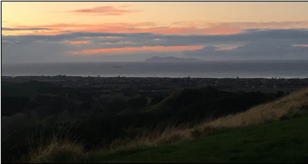
A beautiful evening for a walk!

Secondly we have volunteered at the local Bay of Plenty Breast Cancer Support group with the running of their 10th annual Papamoa Hills Night Walk. A beautiful calm night under a near full moon with lots of happy walkers supporting a valuable charity to those going through the Breast Cancer journey.